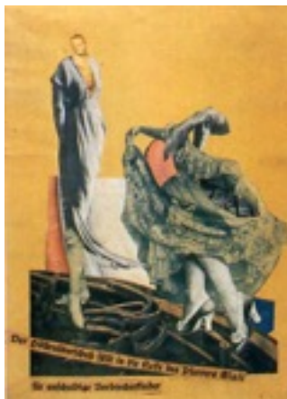
Hannah Hoch. Dada Dance. 1922.