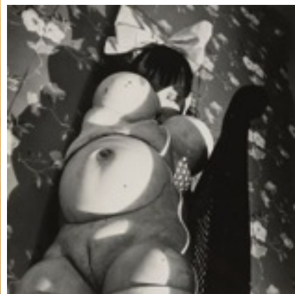
Hans Bellmer. La Poupée. 1935 - 1938.