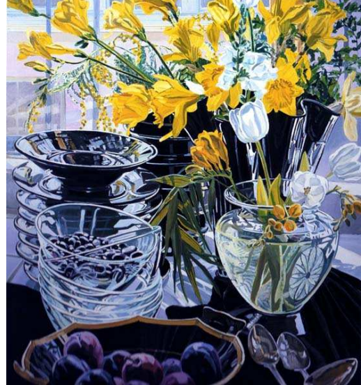
Janet Fish. Black Vase with Daffodils. 1980.