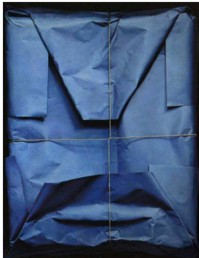
Claudio Bravo. Package. 1969.