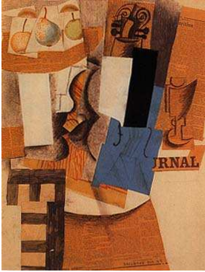
Pablo Picasso. The Violin. 1913.