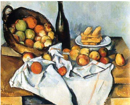
Paul Cezanne. Still Life with Basket of Apples. 1890 - 94.