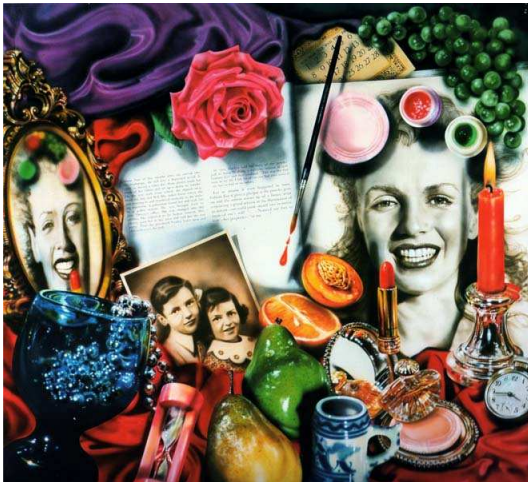
Audrey Flack. Marilyn (Vanitas). 1977.