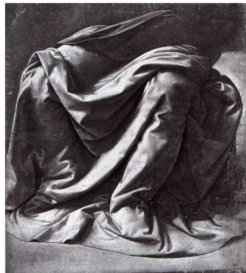
Leonardo da Vinci. Study of Drapery. c. 1473.