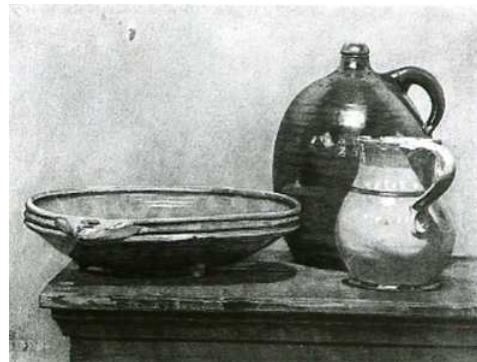
Willem de Kooning. Still Life: Bowl, Pitcher and Jug. c. 1921.